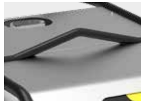
Single central bar for vertical lifting with crane or winches