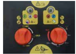
Professional control panel with new electronic system