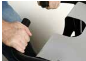
Handle for practical use